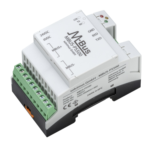
Figure 2: MBUS-PS500

The following connectors are available at the MBUS-PS: