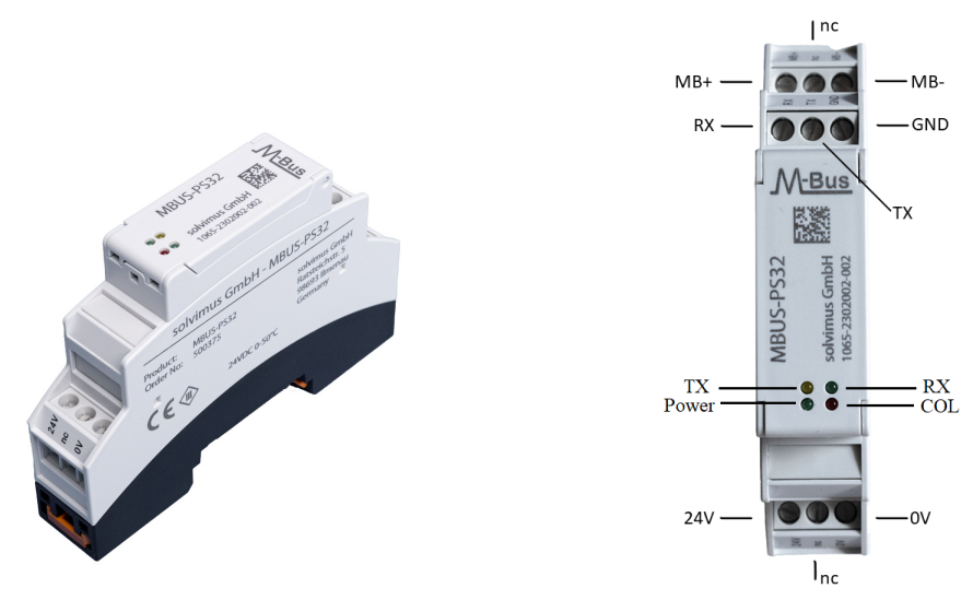
Figure 1: MBUS-PS32, view (left), connectors and LEDs (right)